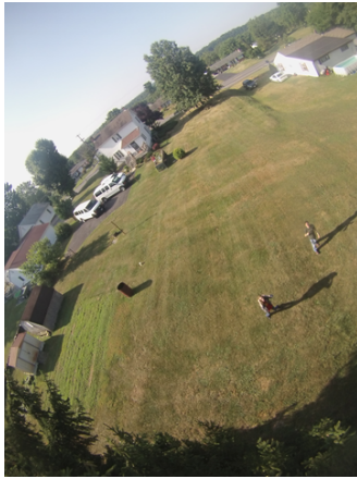
"Landing Struggles" by Bach's Box