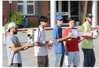
Payload leads ready to launch their payloads!